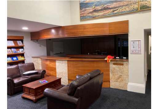
LOBBY - LOOKING WEST