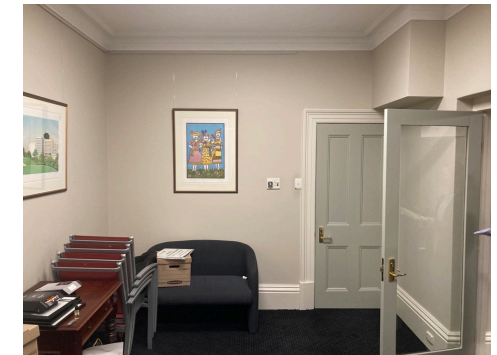
MEMBERS MEETING - LOOKING NORTH