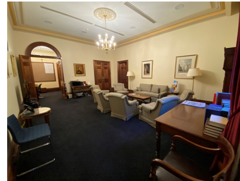
LOUNGE - LOOKING NORTH