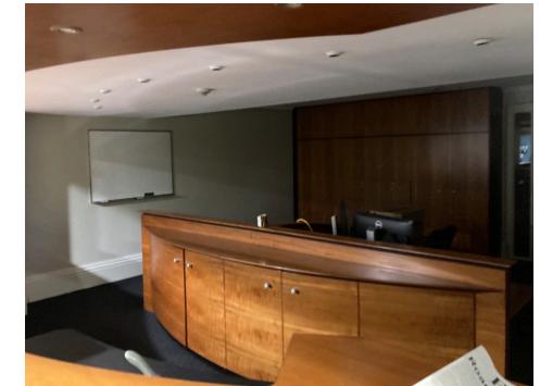
MEMBERS ADM. LOOKING NORTH WEST